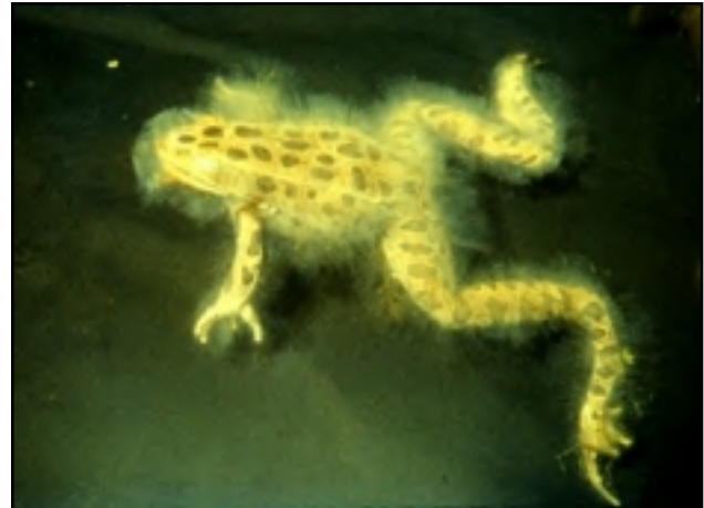
Achlya on frog.