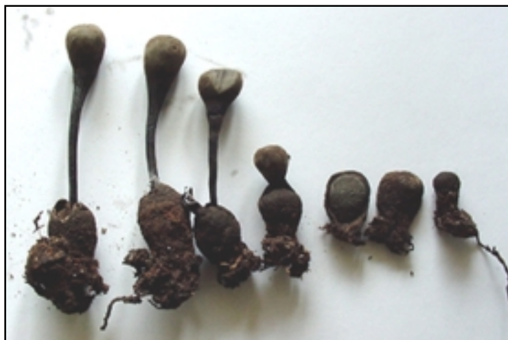
Pseudotulostoma volvata.