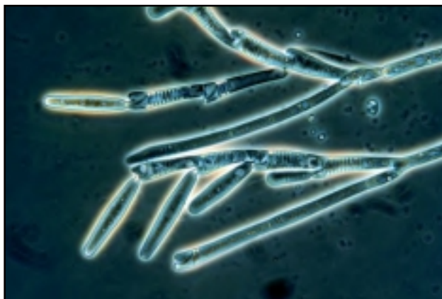
Genistelloides helicoides Williams & Lichtwardt (Harpellales, Legeriomycetaceae) from the hindgut of a stonefly nymph ( Zapada haysi ) from a Rocky Mountain stream. Developing trichospores. Note the coiled appendages within the generative cells from which the trichospores grow. In this genus the appendages become visible before the exogenous trichospores begin to develop.